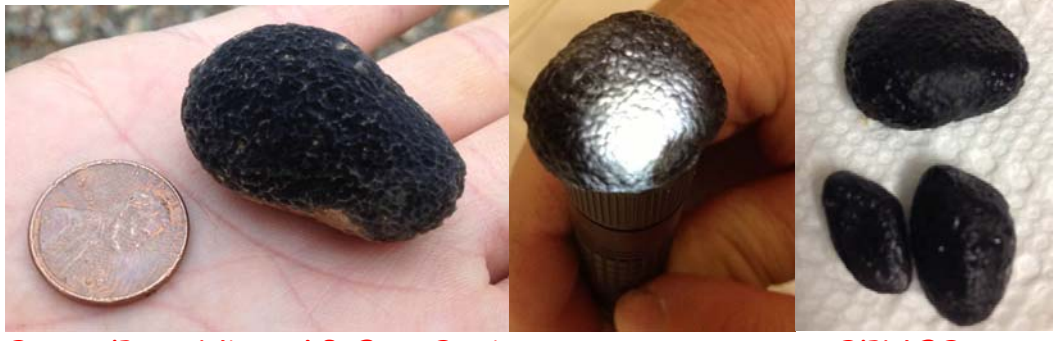
Santa Rosa Mineral & Gem Society

Our local Tektites look like black obsidian balls with lots of craters and pits. Most are the size of an almond, the largest local Tektite found is the size of a golf ball. The best time to hunt for our local Tektites is on a sunny day after it has recently rained. They will look blacker than black - and sometimes, you're able to shine a light through them.