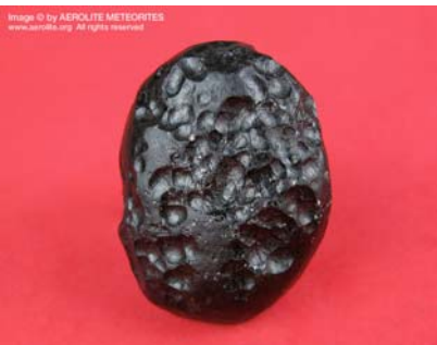
There are only 7 known places where Tektites are found in the world. And recently an 8<sup>th</sup> place has been discovered - in Healdsburg, CA.!!